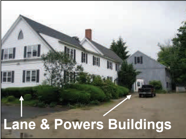
Lane & Powers Buildings

Design: Two story buildings, recently renovated Construction: Wood Current Use: Administrative Offices & Cafe Square Footage: 9,287± SF (combined) Notes: The 2 buildings are currently combined.