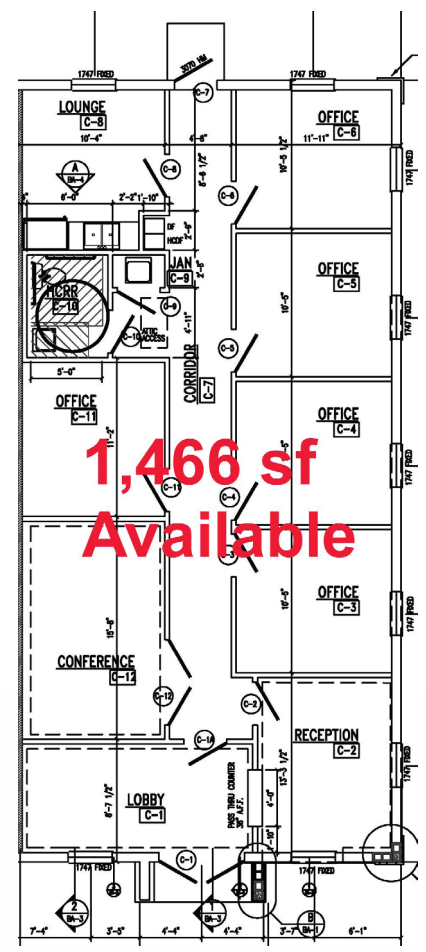
2435 Brunello Trace

2420 Brunello Trace = 2,200 sf Also Available with same Floor Plan